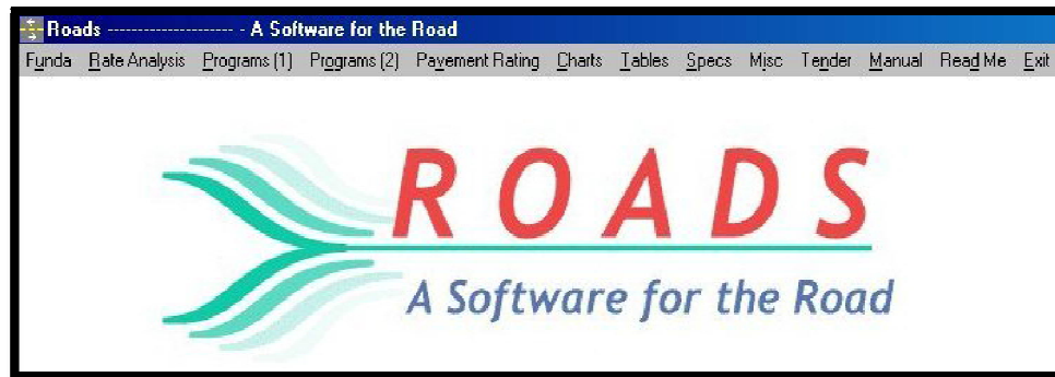
Fig 1.0: A Software for the Road